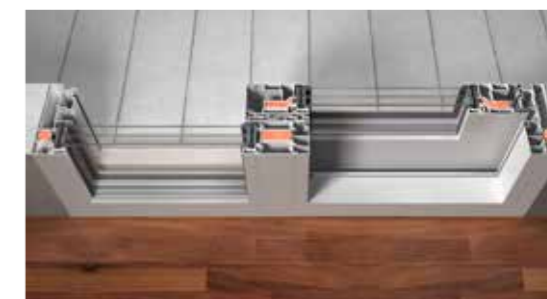
6800i 2 Lift & Slide (one sliding sash & a fixed glazing part)